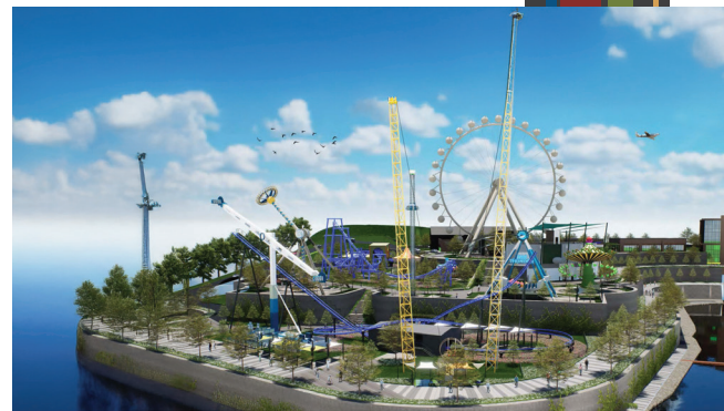
Oasis at Lakeport Resort Renders, 2025

A multi-asset resort in a rural market requires a capital structure that supports ground-up construction, multiple revenue streams, and significant infrastructure. Traditional lenders often limit proceeds or terms for developments with this level of complexity. The borrower needed a coordinated approach that aligned construction through stabilization financing with long-term objectives and public support.